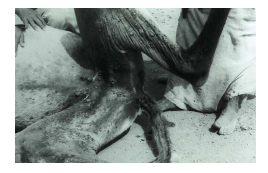
Fig. 2: Camel pox: A three year-old female camel showing pox eruptions on the groin and inner thighs.