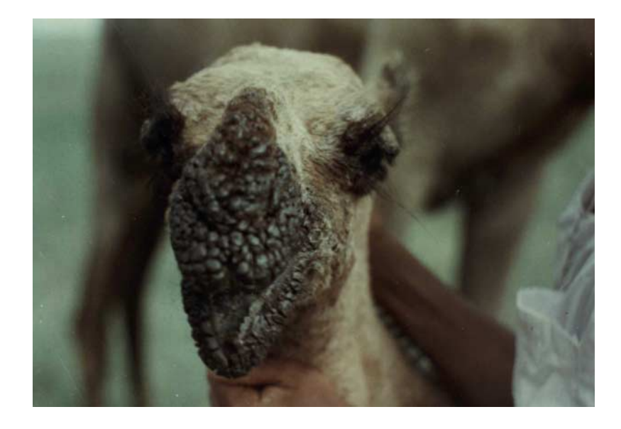
Fig. 5: Camel contagious ecthyma: A close-up view of face affected camel showing scabby lesions around the lips, nostrils and eyes. Note, the lower lip is pendulous.