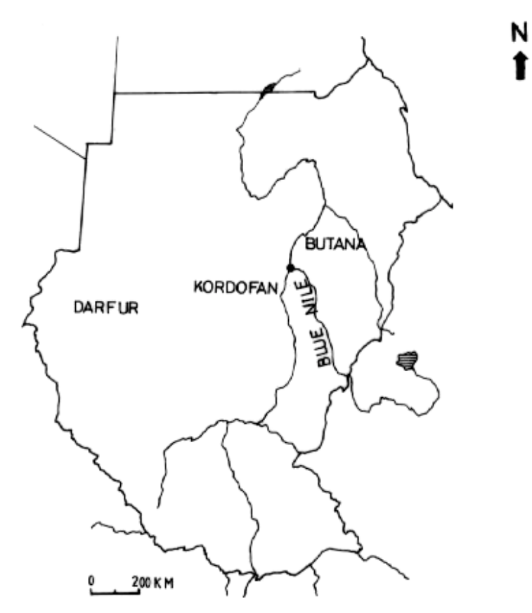
Fig. 1: Map of Sudan showing the study area

Research Project which aimed at the study of the husbandry and production parameters of camels in Butana area (Agab, 1993). In each visit to Butana area, an additional 15 to 20 herds which were not covered by the above mentioned project were also investigated. Frequent visits were made to the study area between July 1993 and December 1994. During the period of the study, the areas were visited eight times in response to reports of outbreaks of pox or poxlike diseases. Camel herds were investigated for the occurrence of camel pox, CCE and camel papillomatosis. Sick animals were carefully examined for clinical signs, number and location of skin lesions and also for the general body condition. Additional data concerning age and sex of animals affected or dead were collected. Herders' accounts of disease history and the progress of signs were also recorded.