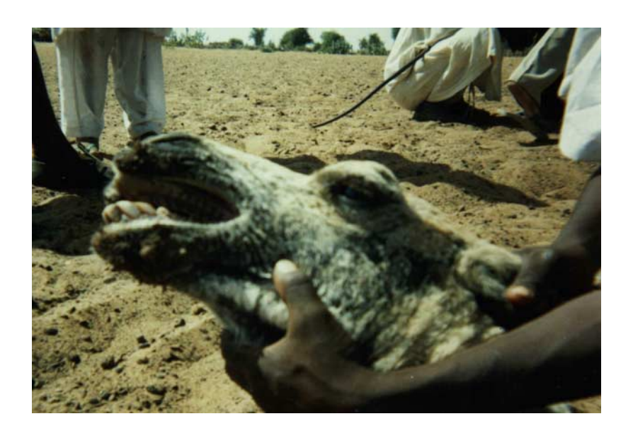
Fig. 6: Camel papillomatosis: Advanced stage of the wart growth on the upper and lower lips and the submandibular area.

The clinical picture of camel papillomatosis that observed in the present study was similar to that described by Dioli and Stimmelmayr (1992) in Kenya. The wart lesions appeared as round, cauliflower-like horny masses of 0.3-1.5 cm in diameter. The lesions first appeared as small flat elevations, rosy in color or hyperemic. Later, and within 1-2 weeks, they developed into round fissured or cauliflower-like horny masses taking the normal color of the skin (Fig. 6).