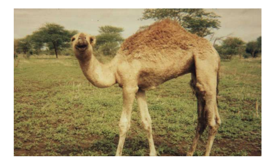
Fig. 4: Camel contagious ecthyma: Acutely affected young camel showing swelling of the head and upper part of the neck.